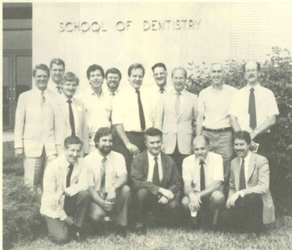
Instructors and Participants Direct Gold Course Indiana University School of Dentistry June 17-20, 1986

The committee will discuss the scheduling of the next course during the Foil Academy meeting in October. It appears that June is the best time for most of those interested in taking the course as well as the instructors.