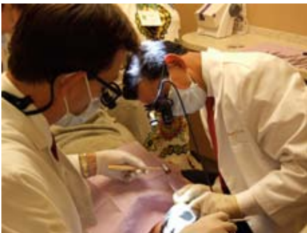
UCLA duo wax clinical