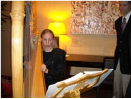
A harpist adds enchantment to a gala evening