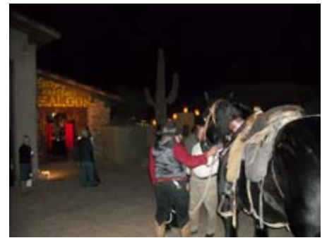
The watering hole