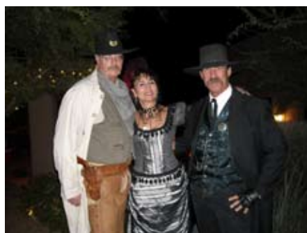
Look out OK corral