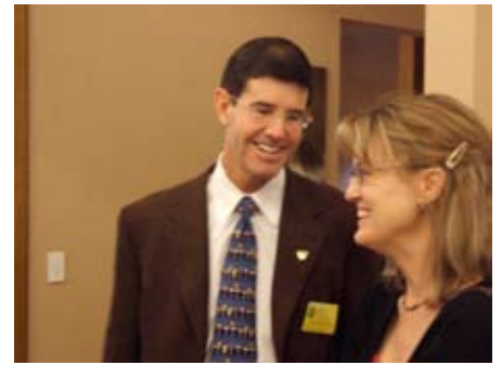
Sharing the moment