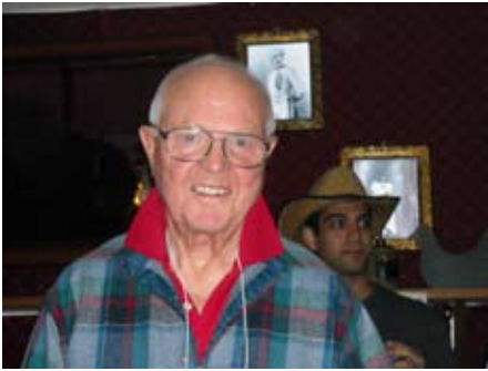
At the hoedown