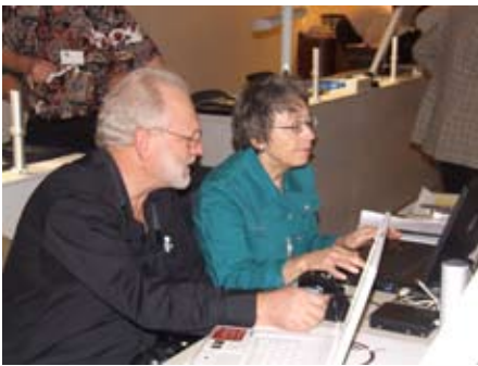
The hardest working duo at the meeting