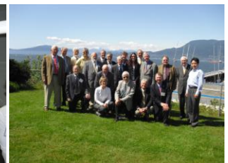
The AFSC Gang

For The Complete Photo Set Including Non-AAGFO Members Go To: www.aagfo.org