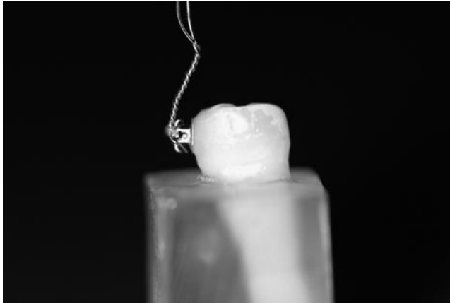
FIGURE 1. Bonded teeth set in acrylic block; a 0.021 × 0.025-inch stainless steel wire was ligated into each bracket slot to minimize deformation of bracket during debonding; a 0.020-inch loop was made from a 0.012-inch stainless steel ligature wire and placed under the gingival wings of the twin bracket.