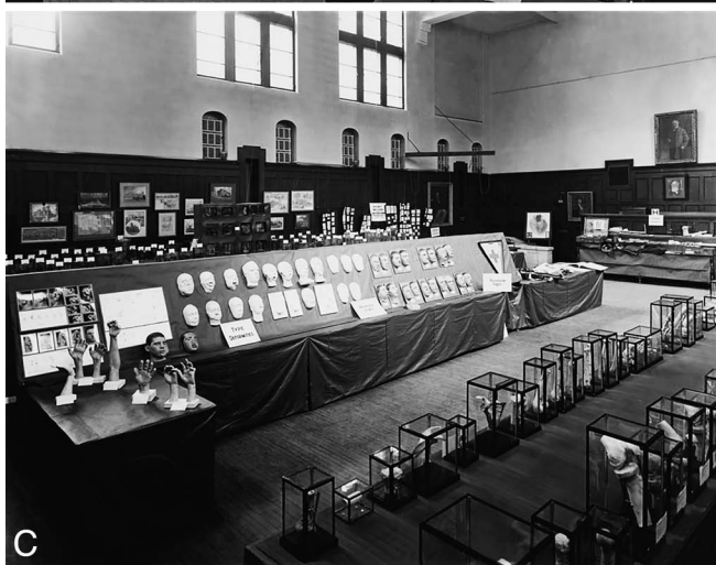
Figure 3. Canadian Medical War Museum exhibit at the American College of Surgeons meeting in Montreal in 1920. A, Macerated bone specimens on the left; wet pathologic specimens on the right; medical prostheses in the middle. B, Macerated bone specimens on the left; wet pathologic specimens on the right; prostheses, photographs, and artwork in the middle. C, Macerated bone specimens in the front and plaster casts showing types of hand or facial deformities and surgical repair in the middle.

the Royal College of Surgeons were retained by the Imperial authorities and an equal number substituted from the National collection. 40p949 These included approximately 200 macerated bone specimens, 300 wet specimens showing gunshot injuries, and other wet specimens (not numerated), as well as many other types of teaching material. It is not clear whether any of the macerated bone specimens he and Keith had published together were included. Hall, when telling the story in 1972, noted that it was so hectic while these materials were being packed up from the RCS Hunterian Museum for shipment to Canada, that “I nearly had some of Hunter’s specimens, but not quite!” 46