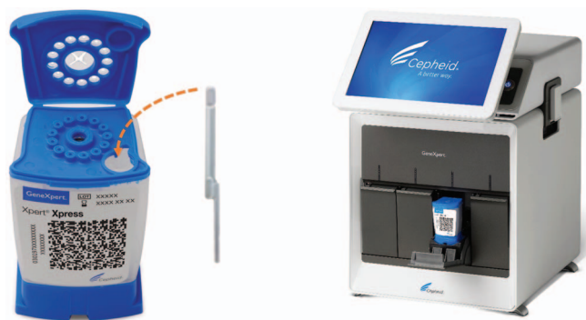
Figure 2. The GeneXpert system.

A key challenge for tests using TP-specific antibodies is the ability to differentiate prior treated infections from current infections, as the antibodies remain positive following treatment. A positive TP test can be followed by a rapid plasma reagin (RPR) test, which can be used to detect an active infection. Although this practice is used in most well-resourced settings, uptake of reflex RPR testing is low in resource-limited settings. One assay has been developed for the simultaneous detection of TP-specific