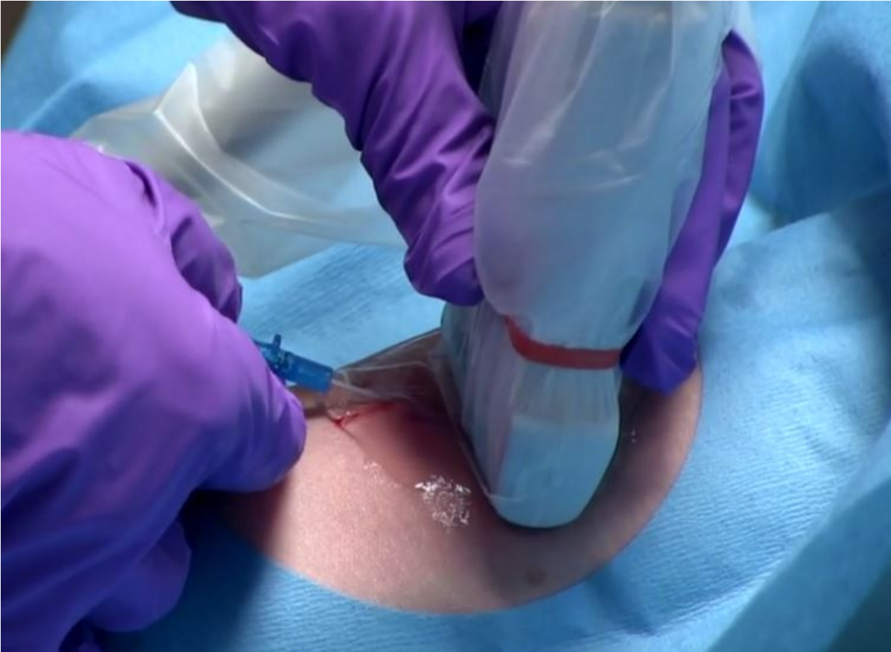
Figure S1. Ultrasound Guided Peripheral Catheter Insertion