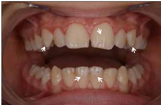
Figure 3. Subject with celiac disease and permanent dentition, presenting grade II systemic enamel defects (slight structural defects), according to Aine (1986) classification. Showing rough enamel surfaces with shallow pits, located in upper and lower central incisors as well as light opacities in the upper canines (arrows).