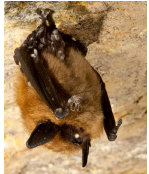
Eastern small-footed bat with white fungus on nose, arms and wings

Federally listed species found in the affected area that have not yet been confirmed with WNS or fungal infection: