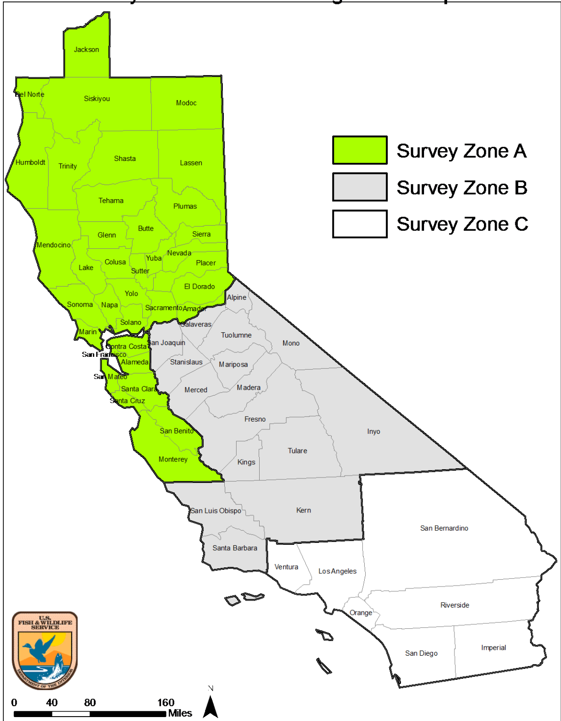
Figure 2. Survey Zones for the Listed Large Branchiopods in California and Oregon