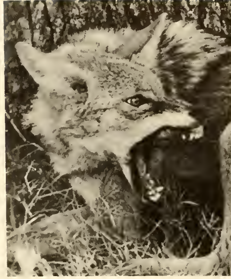
Figure 4. Red wolf (left) and coyote (right) threat behavior. A red wolf's tongue does not normally protrude as shown here.