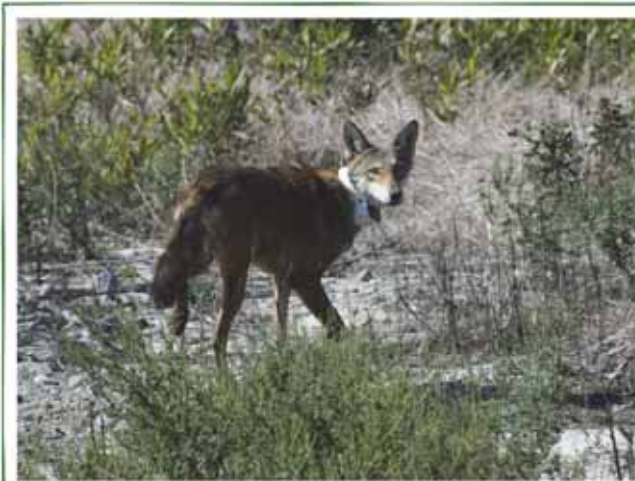
Red wolf with radio-collar

federally listed as Endangered throughout its historic range. However, the red wolf was declared extinct in the wild in 1980 when the last known remaining red wolves were brought into captivity. Therefore, red wolves in captivity are listed Endangered, whereas re-introduced red wolves are designated as a nonessential experimental population under 10(j) of the ESA.