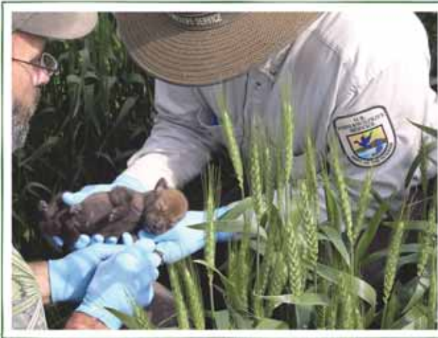
Fostering of red wolves