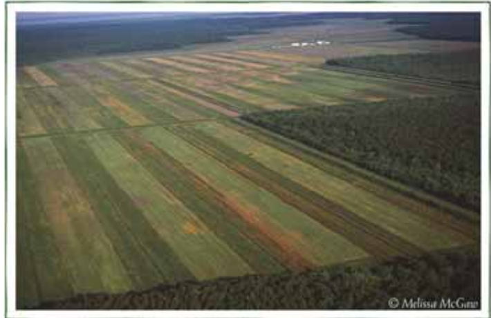
Typical red wolf habitat

recognized that interbreeding between red wolves and coyotes would produce hybrid offspring resulting in coyote gene introgression into the wild red wolf population, and that this introgression would threaten the restoration of red wolves. An adaptive