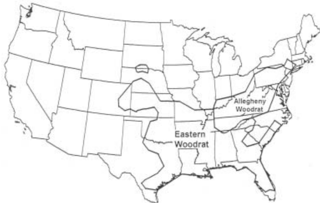
Figure 1. Range of the eastern woodrat and Allegheny woodrat (adapted from Hall 1981).

Habitat. Investigations that compare the rocky cover and food resources available at occupied versus historically occupied sites may reveal environmental factors that affect population survival. Cudmore (1985) in Indiana and Balcom and Yahner (1996) in Pennsylvania have begun to address these issues. The type of timber harvest practices used near woodrat populations may affect use of habitat. In West Virginia, timber harvests near woodrat colonies had minimal impact as long as intact forest remained nearby (Castleberry 2001).